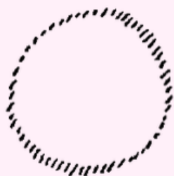
First Logos God