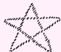
Third Logos Microcosm