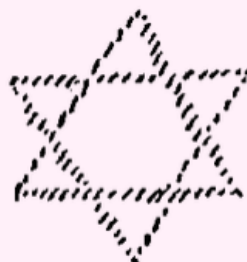
Second Logos Macrocosm